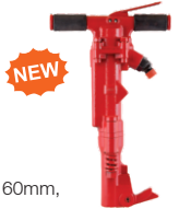
Pneumatic Concrete Breaker CB 117 / CB1210

540mm / 740mm, 1400BPM / 1200 BPM 6BAR, 25x108mm / 32x160mm, 22Kg./ 37kg