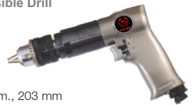
1/2" Reversible Drill RAD-402

1/2", 800 r.p.m., 203 mm 1/4", 3/8", 8 cfm, 1.6 kg