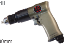
3/8" Reversible Drill RAD-302

3/8", 1800 r.p.m., 180mm 1/4", 3/8", 6 cfm, 1.1 kg