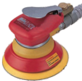
Dust Free Orbital Sander OS-303

5" velcro type, 10,000 r.p.m. 1/4", 3/8", 12 cfm 5 mm, 0.9 kg