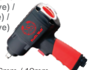
Composite Impact Wrench IW-0981T (3/8" Sq. Drive) / IW-1281 (1/2" Sq. Drive) / IW-1930T (3/4" Sq. Drive)

Bolt Capacity - 13mm / 16mm / 19mm Max Torque-380N-M / 1356N-M / 1356N-M Weight-1.2Kg / 2.2Kg / 2.2Kg