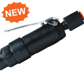
Industrial Air Die Grinder DG 6-35

6mm, 35000 r.p.m., 165mm 1/4" NPT, 0.45 Kg.