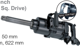
Air Impact Wrench IW-2500T-2 (1" Sq. Drive) IW-2500T-8 IW-2570T-8

2500 r.p.m., 1/2", 50 mm 345 kg/m, 8.5 cfm, 622 mm 1 inch, 14.6 kg.