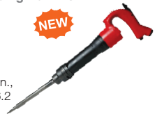
Pneumatic Chipping Hammer CH3

Blower 2100 per min., Length of Stroke 76.2 1.2 BSP, 6.5 Kg.