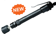
Pneumatic Bench Sand Rammer BSR1 FSR1

Blows 850 per min., Length 530mm/1258mm Stroke 102mm/152mm Air Inlet 3/8" NPT / A 1/2"BSP, 5.7Kg.